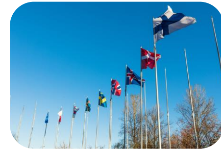
Promoting Nordic Cooperation